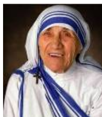
Columbario Madre Teresa

Si es nuevo en la parroquia, ha cambiado de dirección o número de teléfono o se ha mudado, comuníquese con la oficina parroquial al 378-2720 para que podamos actualizar nuestra lista. ¡Gracias!