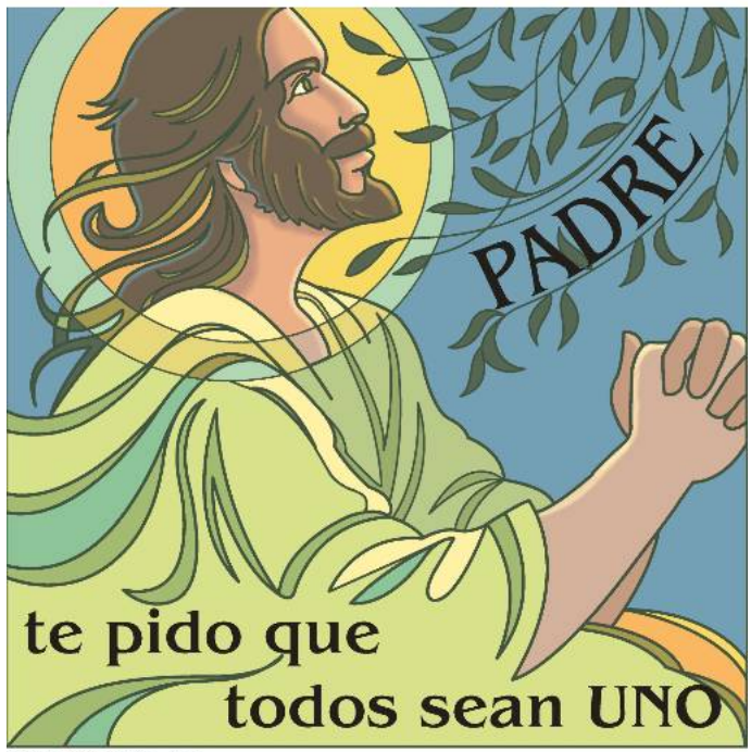
C J. S. Paluch Co., Inc.