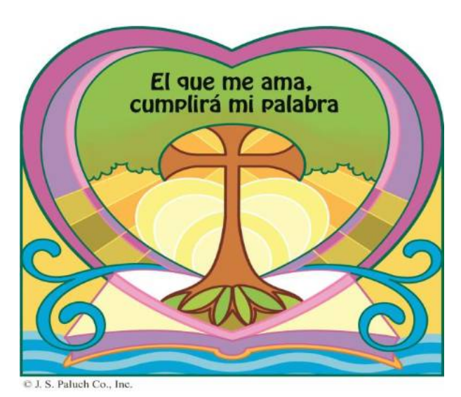
22 Mayo 2022 Sexto Domingo de Pascua