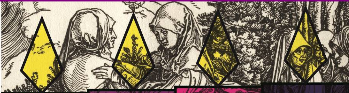
The Visitation Albrecht Dürer (German, 1471-1528), c. 1504 Cleveland Museum of Art

Elizabeth, filled with the Holy Spirit, cried out in a loud voice and said, "Blessed are you among women, and blessed is the fruit of your womb." Luke 1:41-42