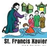
St. Francis Xavier