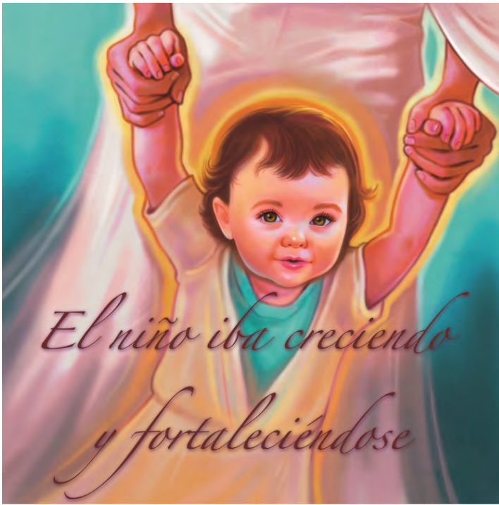
© J. S. Paluch Co., Inc.