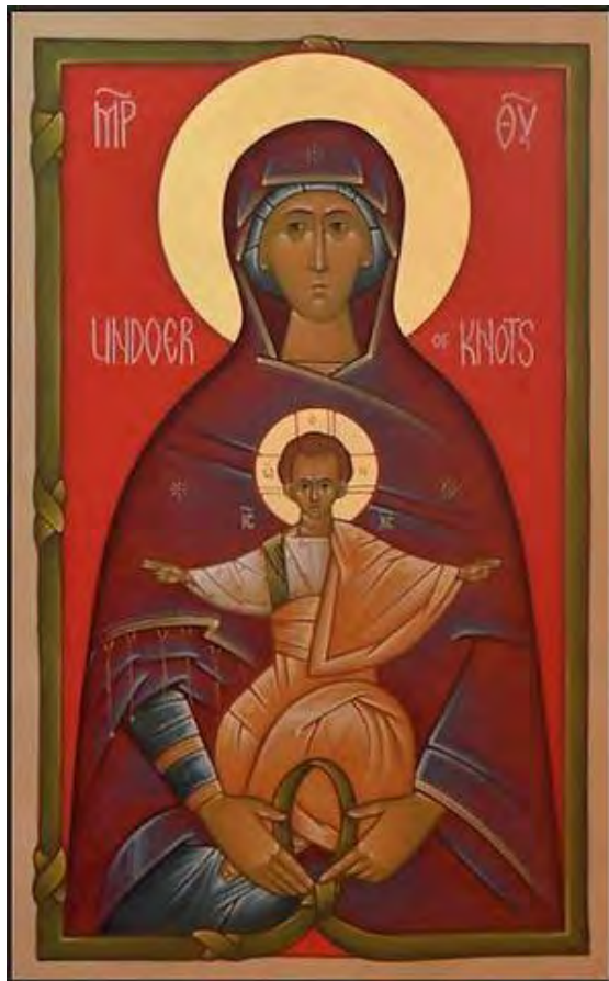
Our Lady Undoer of Knots

This image, downloaded from the website www.azrosary.net is recommended for use during the Rosary celebration