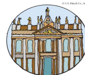
The Dedication of the Lateran Basilica

Sunday: Thirty-first Sunday in Ordinary Time; National Vocation Awareness Week; Daylight Saving Time ends Monday: St. Charles Borromeo Tuesday: Election Day Saturday: The Dedication of the Lateran Basilica