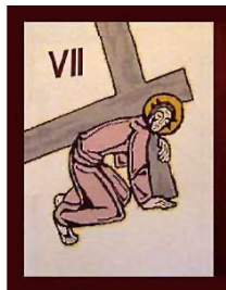
Jesus falls a second time.

A very special thank you to everyone who donated all their new and gently used religious items for the MOMS OF MERCY first annual "GREAT GIVE AWAY" last Sunday after the 7:30 & 9:30am Masses. It was a huge success.