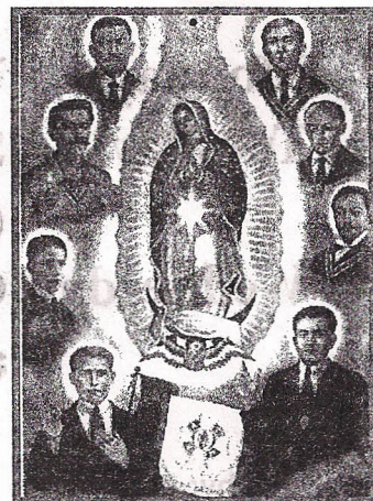
SANTOS MÁRTIRES MEXICANOS