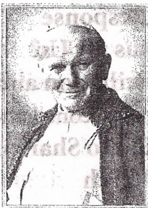
San JUAN PABLO II°