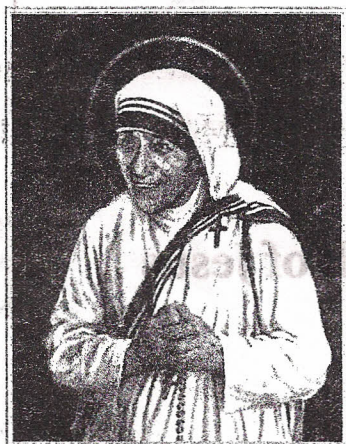
Santa MADRE TERESA DE CALCUTA

"El testimonio admirable de los santos nos estimula con su ejemplo en el camino de la vida" (Cfr. Prefacio II de los SANTOS)