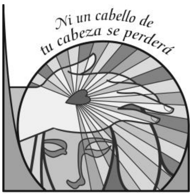
C.J. S. Paluch Co., Inc