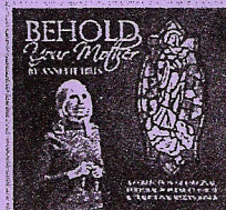
Behold Your Mother